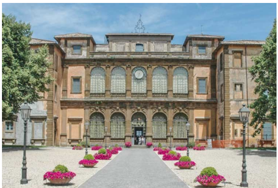
Villa Mondragone is the largest and one of the most beautiful villas of Tusculanum. The monumental complex has been acquired in 1981 by the University of Rome Tor Vergata. Villa Mondragone over the course of its long history hosted important events. It was the residence of Popes and famous families of the ancient nobility and is now a congress center